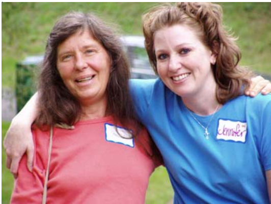
Circles of Support engage the community to end poverty in Duluth.