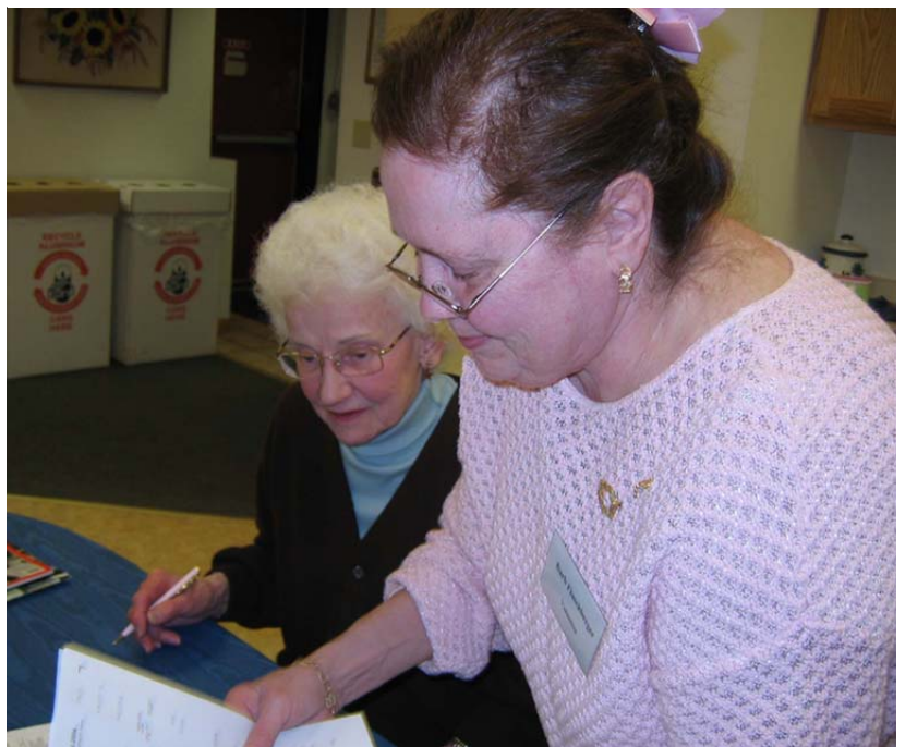
A volunteer helps a community member prepare her tax return at Community Action Duluth's free tax clinic.

Engaging the community through building partnerships to develop a blueprint for ending poverty in Duluth is the long-range goal of Community Action Duluth.