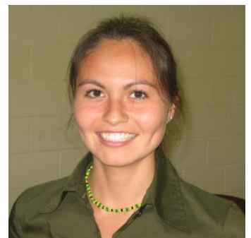
Autumn Day Family Employment Advocate